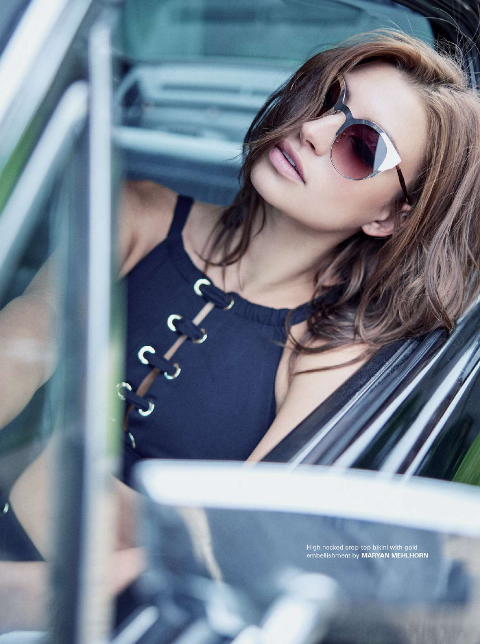
High necked crop-top bikini with gold embellishment by MARYAN MEHLHORN