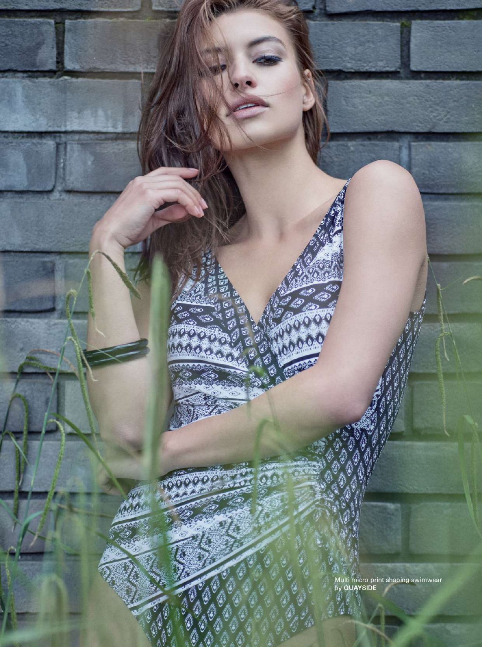
Multi micro print shaping swimwear by QUAYSIDE