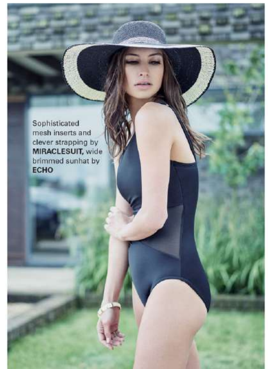
Sophisticated mesh inserts and clever strapping by MIRACLESUIT , wide brimmed sunhat by ECHO