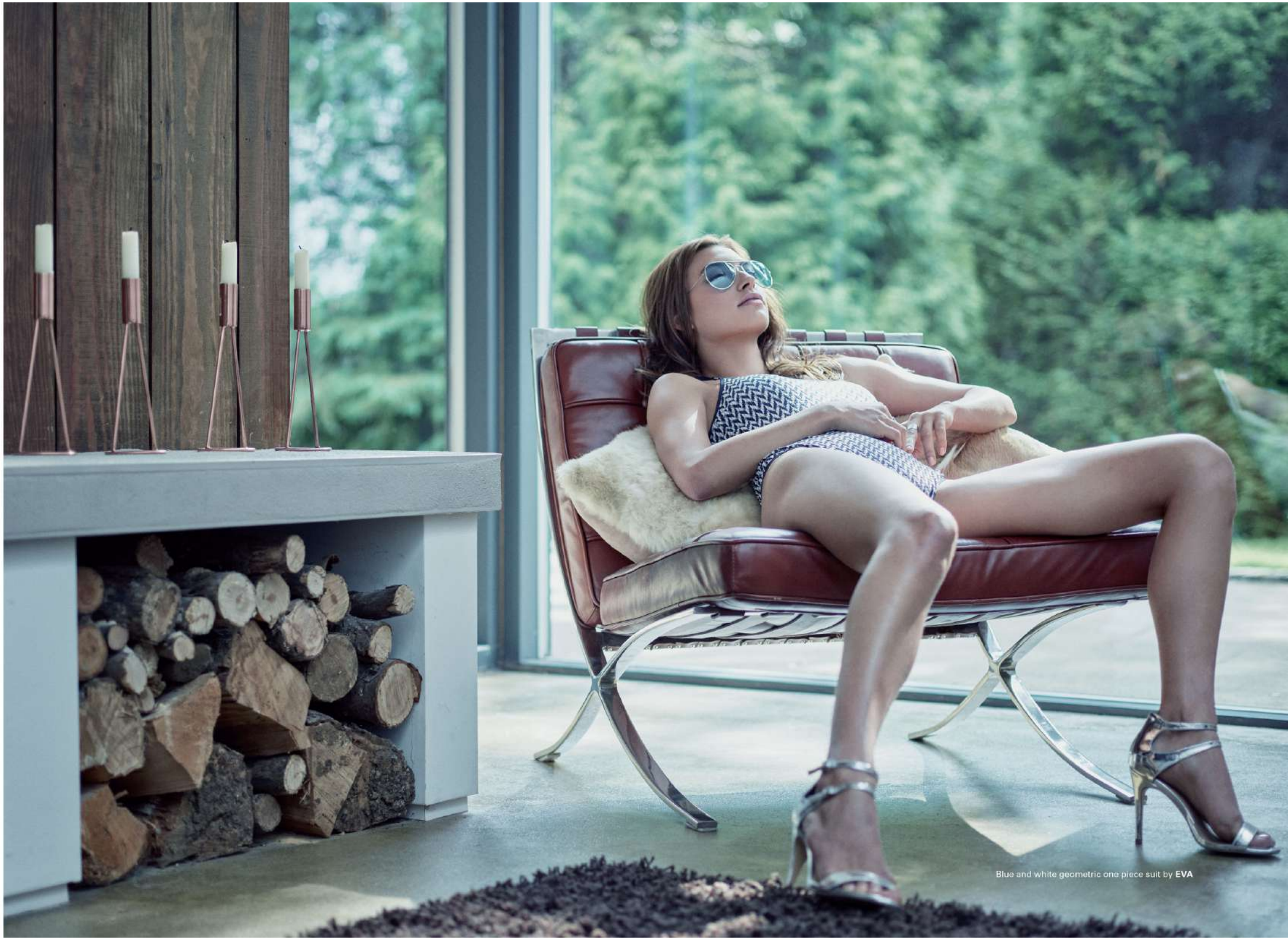
Blue and white geometric one-piece suit by EVA