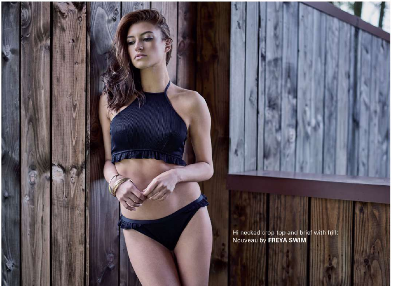
Hi necked crop top and brief with frill: Nouveau by FREYA SWIM